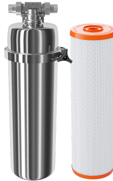
Cartridge B520 PRO for Prefilter AQUAPHOR Viking