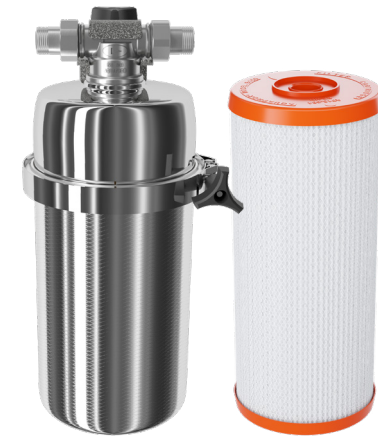
Cartridge B515 PRO for Prefilter AQUAPHOR Viking Midi